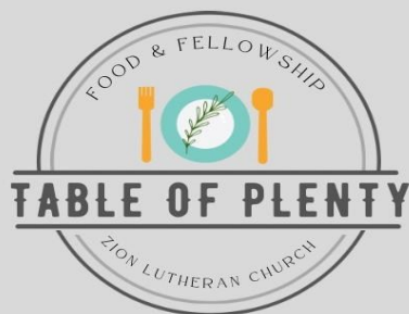
Table of Plenty

The April Table of Plenty meal will be Monday, April 27 from 5:30-7:00 PM in the Zion Lutheran fellowship hall. Make plans to join us for delicious food and fellowship!