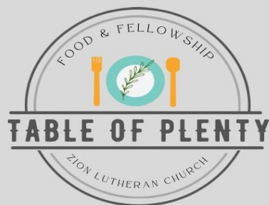
Table of Plenty

The February Table of Plenty meal will be Monday, February 23 from 5:30-7:00 PM in the Zion Lutheran fellowship hall. Make plans to join us for delicious food and fellowship!