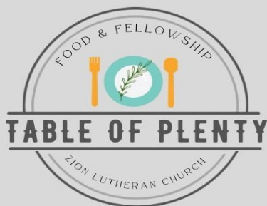
Table of Plenty

The January Table of Plenty meal will be Monday, January 26 from 5:30-7:00 PM in the Zion Lutheran fellowship hall. Make plans to join us for delicious food and fellowship!