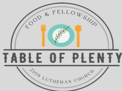
Table of Plenty

The summer Table of Plenty meals will be Mondays, June 23rd and July 28th from 5:30-7:00 PM in the Zion fellowship hall. Make plans to join us for delicious food and fellowship!