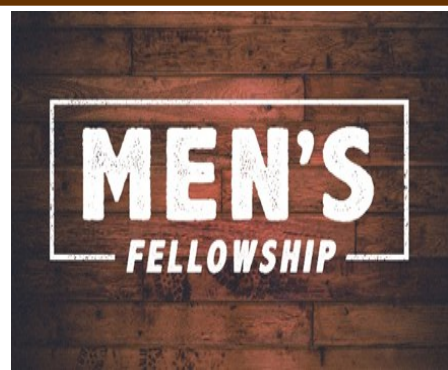
Table of Plenty

On Wednesday, January 29 at 8 PM , there will be a men's meeting at Dempsey's for an opportunity for fellowship. This is intended to be extremely informal and an opportunity to get to know one another. Please feel free to invite a friend, and we will see you there!