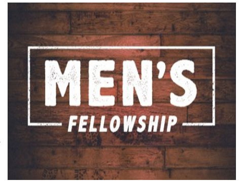
Table of Plenty

**Please note the change in date due to the Christmas holiday!**