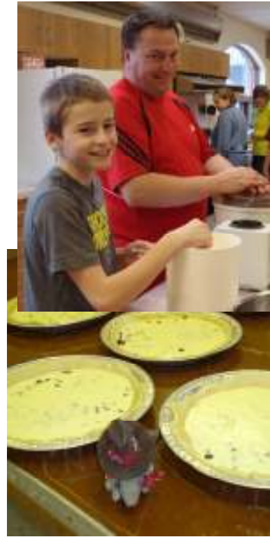
Youth kuchen baking - Thanks to all who ordered or helped with the kuchen fundraiser in any way.